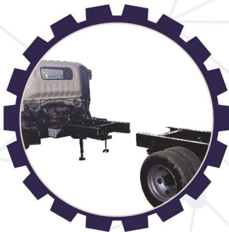
Chassis oxy-cutted for extension process

Y&L offers a wide range of truck chassis and wheelbase extension or reduction. We are fully committed to deliver our highest quality product & services to the total satisfaction of our customers.