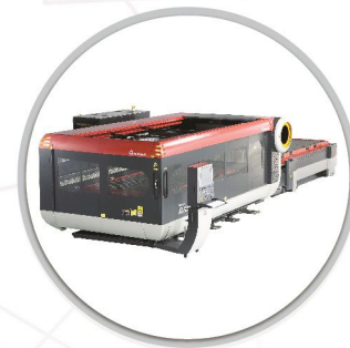
AMADA Laser Cutting Machine