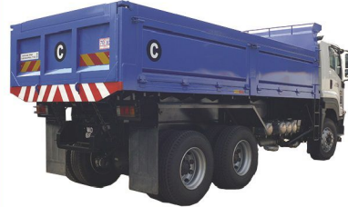
TIPPER'S STEEL BOX