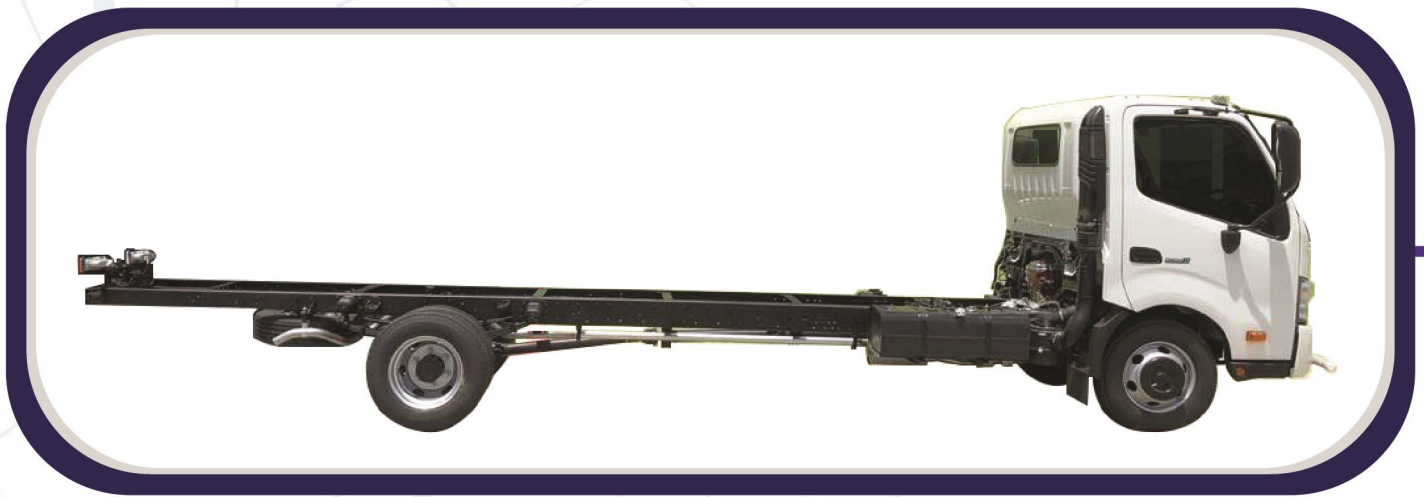
Fully extended chassis & wheelbase.