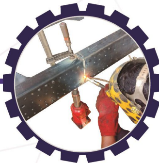
Chassis welding process