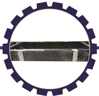
Complete welding of joint wheelbase