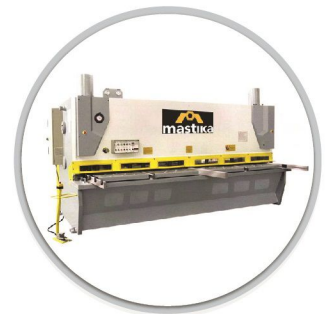
Metal Sheet Shearing Machine