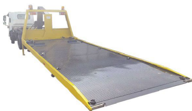
CAR CARRIER (FULL DROP)