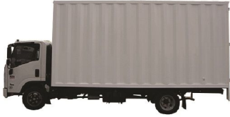
STEEL CORRUGATED BOX