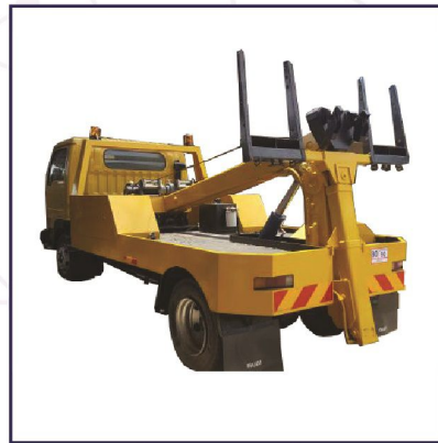
RECOVERY TOWING TRUCK