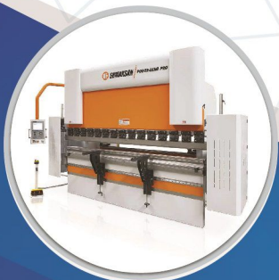
CNC Bending Machine