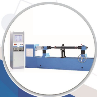
Long Shaft Balancing Machine